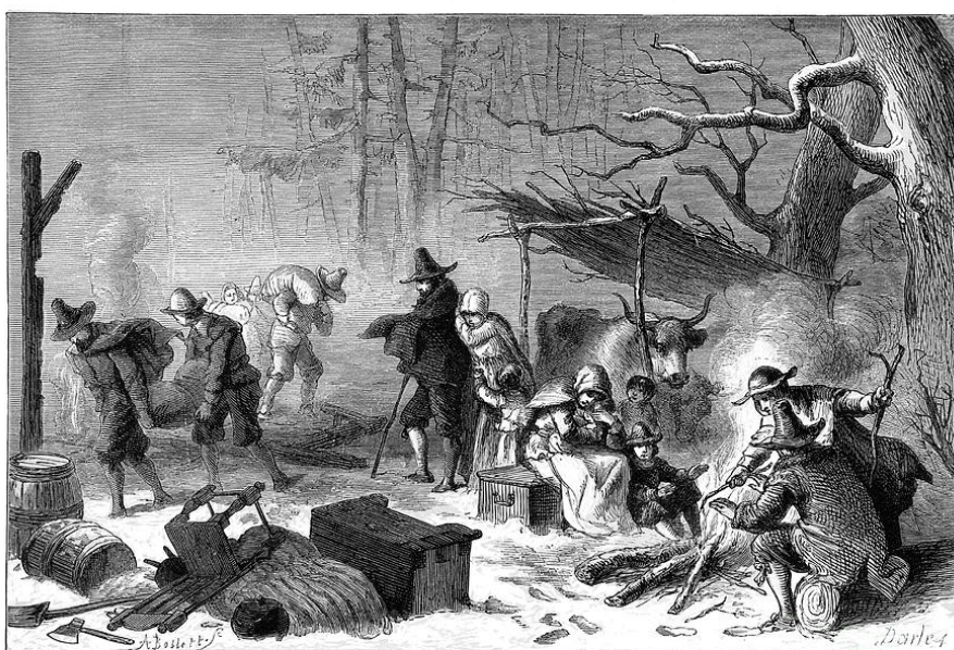
ENGLISH SETTLERS IN AMERICA.

Do you like the winter season? How was the first winter season for these people from England in a new country? Winter was difficult for them, so they visited the Powhatan Indians because they probably wanted to trade with them. The people from England could give guns and swords and the Indians could give food. These meetings were not friendly.